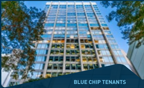
BLUE CHIP TENANTS