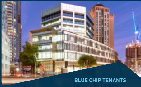
BLUE CHIP TENANTS