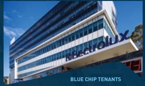
BLUE CHIP TENANTS