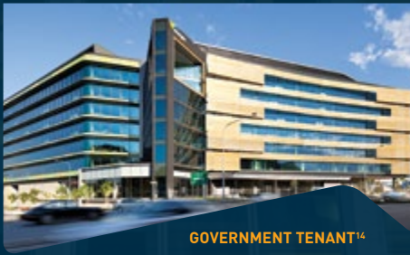
GOVERNMENT TENANT 14