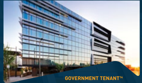
GOVERNMENT TENANT 14