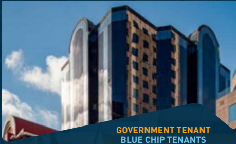
GOVERNMENT TENANT BLUE CHIP TENANTS